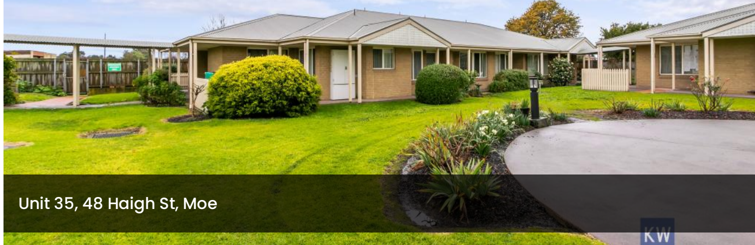
Unit 35, 48 Haigh St, Moe