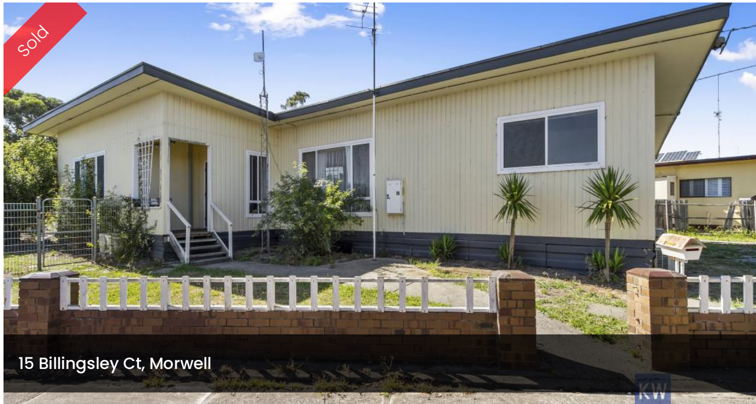
15 Billingsley Ct, Morwell