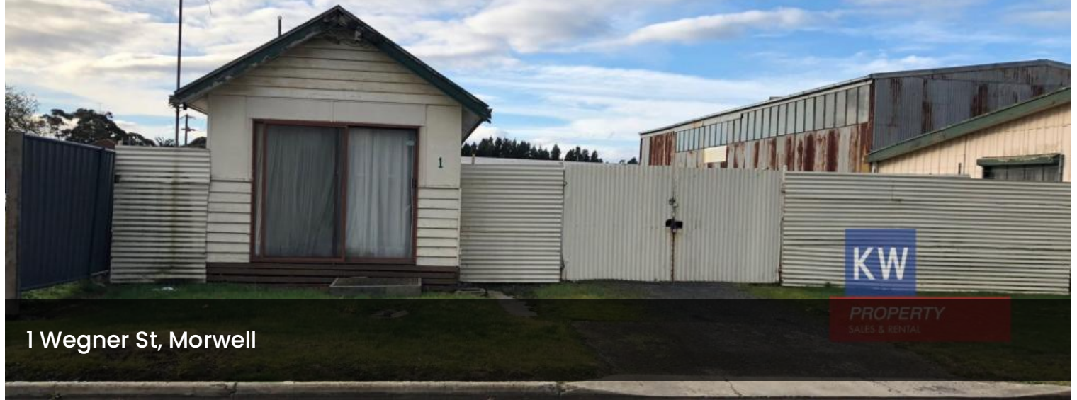
1 Wegner St, Morwell