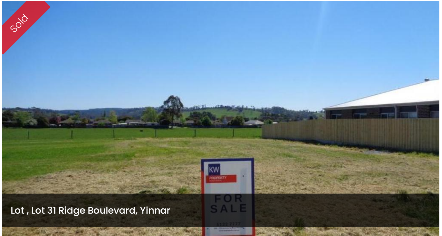
Lot , Lot 31 Ridge Boulevard, Yinnar